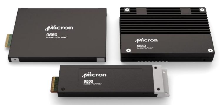
Micron 9550 NVMe SSD

Micron IP and components are fully vertically integrated with Microndesigned controller ASIC, 232-layer NAND, DRAM, firmware, and validation.